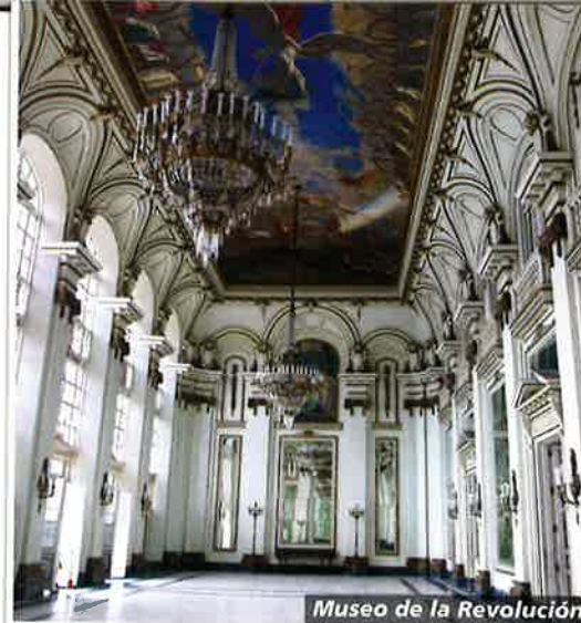
Museo de la Revolución